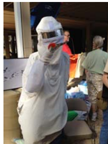
Whooping Crane Handler's Costume